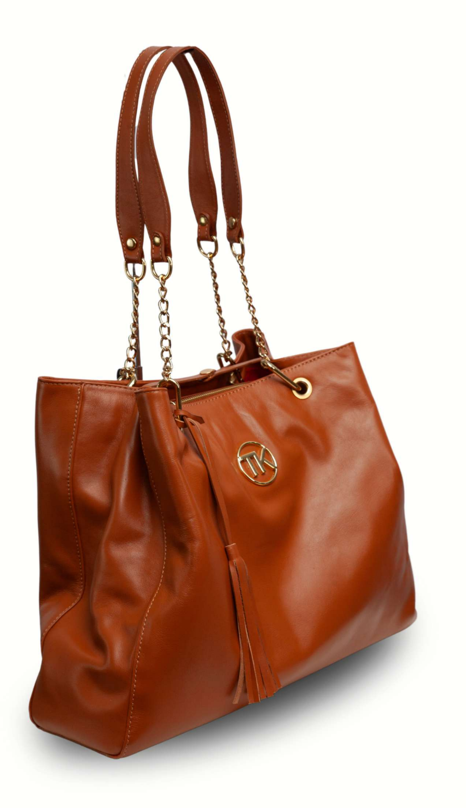
REf. 166 MUNICH / A= 31 L=40 P= 17