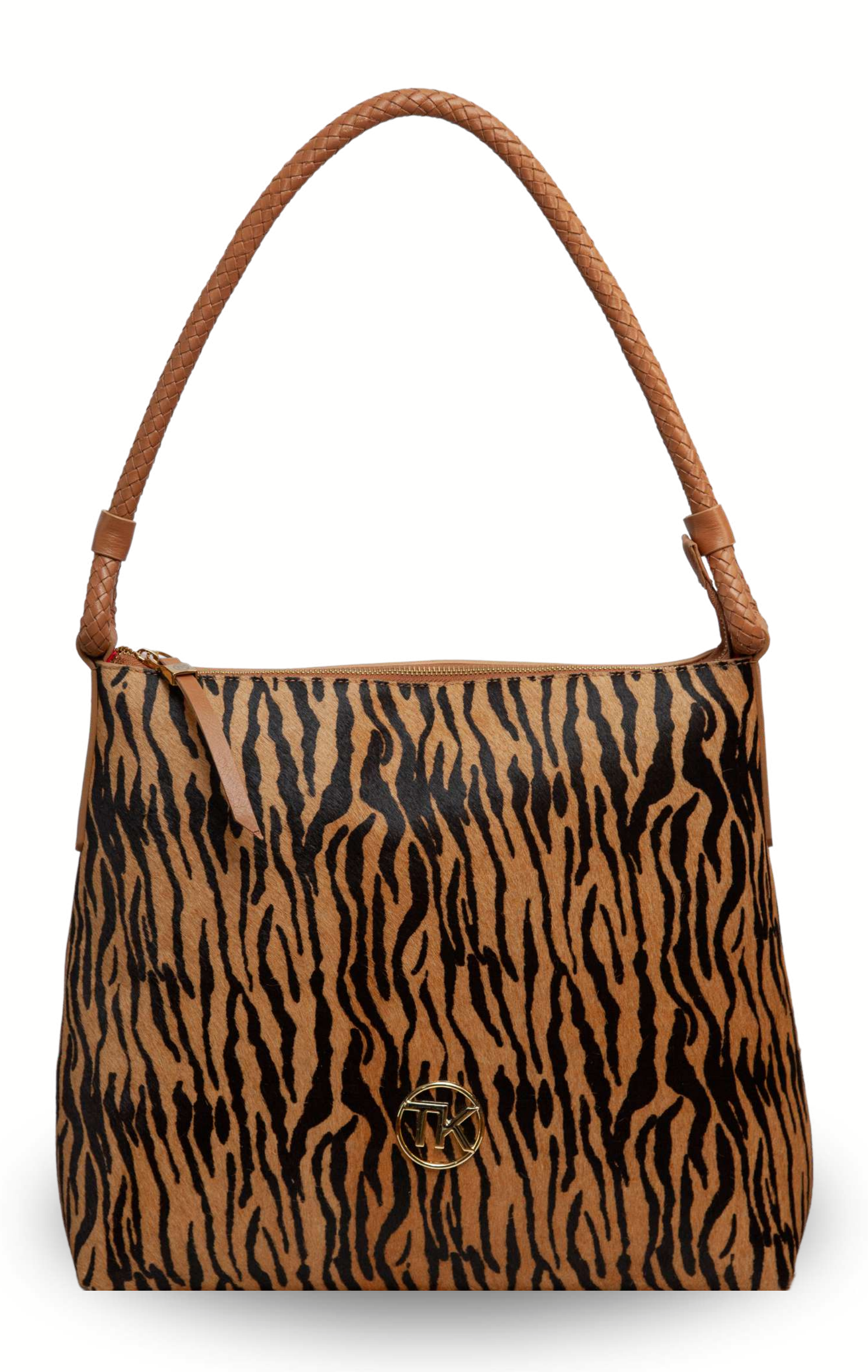
Ref. 170 B = VERSAILLES / A=30 L =35 P=13