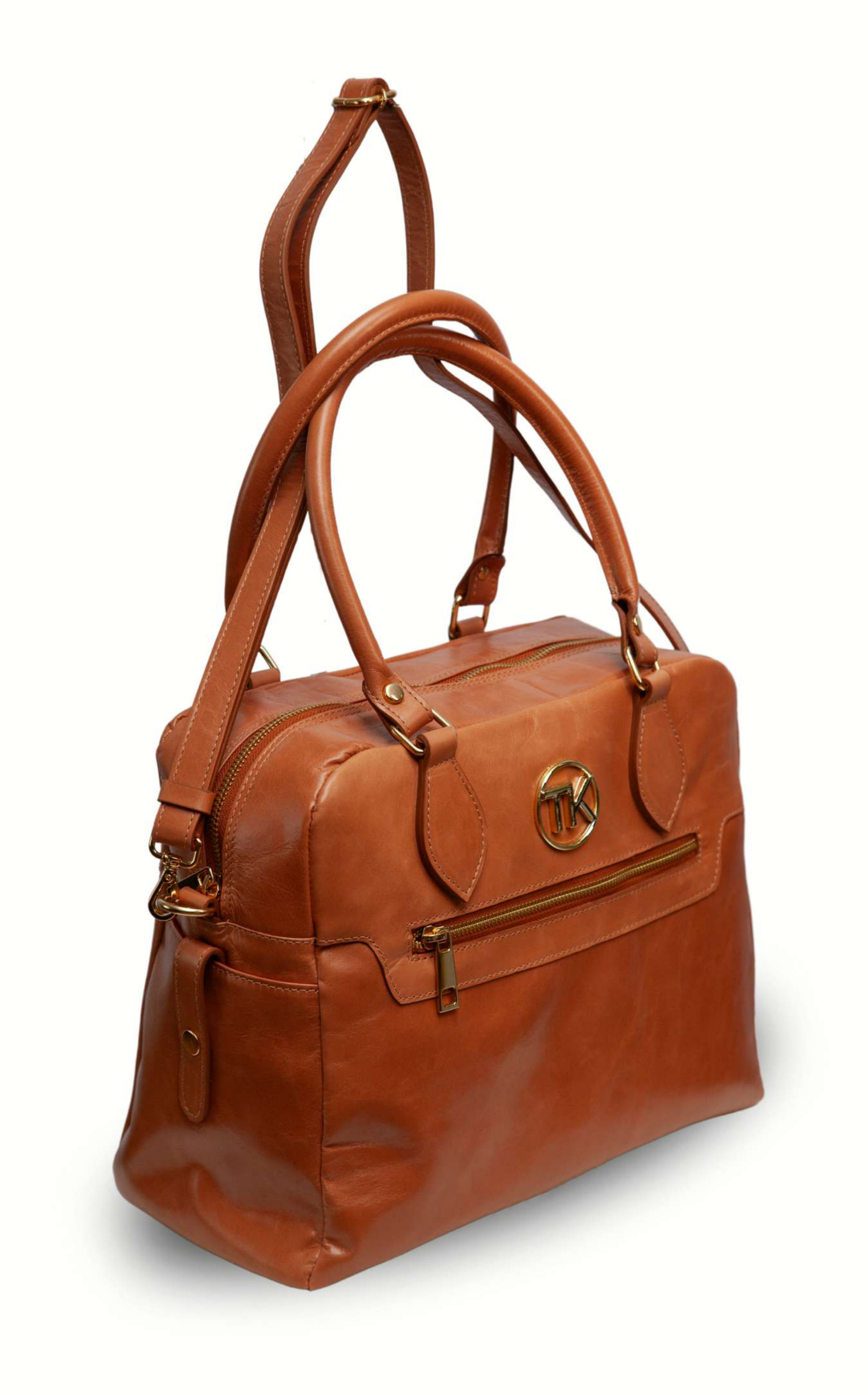
Ref. 174 = IPANEMA / A = 41 L = 31 P = 5