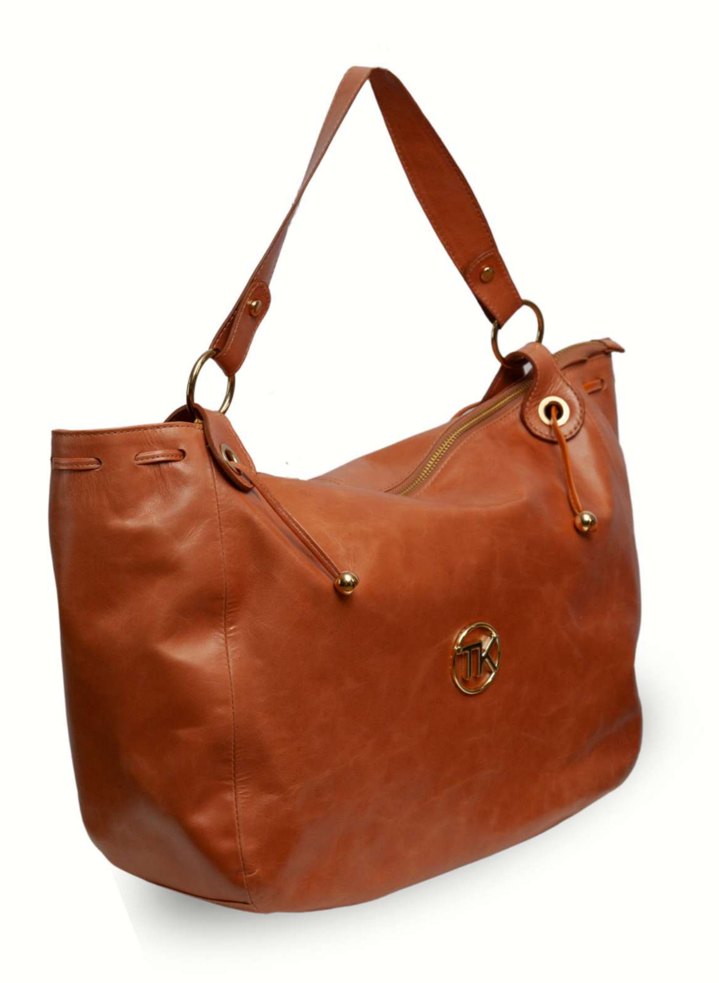
REF 161 SEATTLE / A=32 L=52 P=15