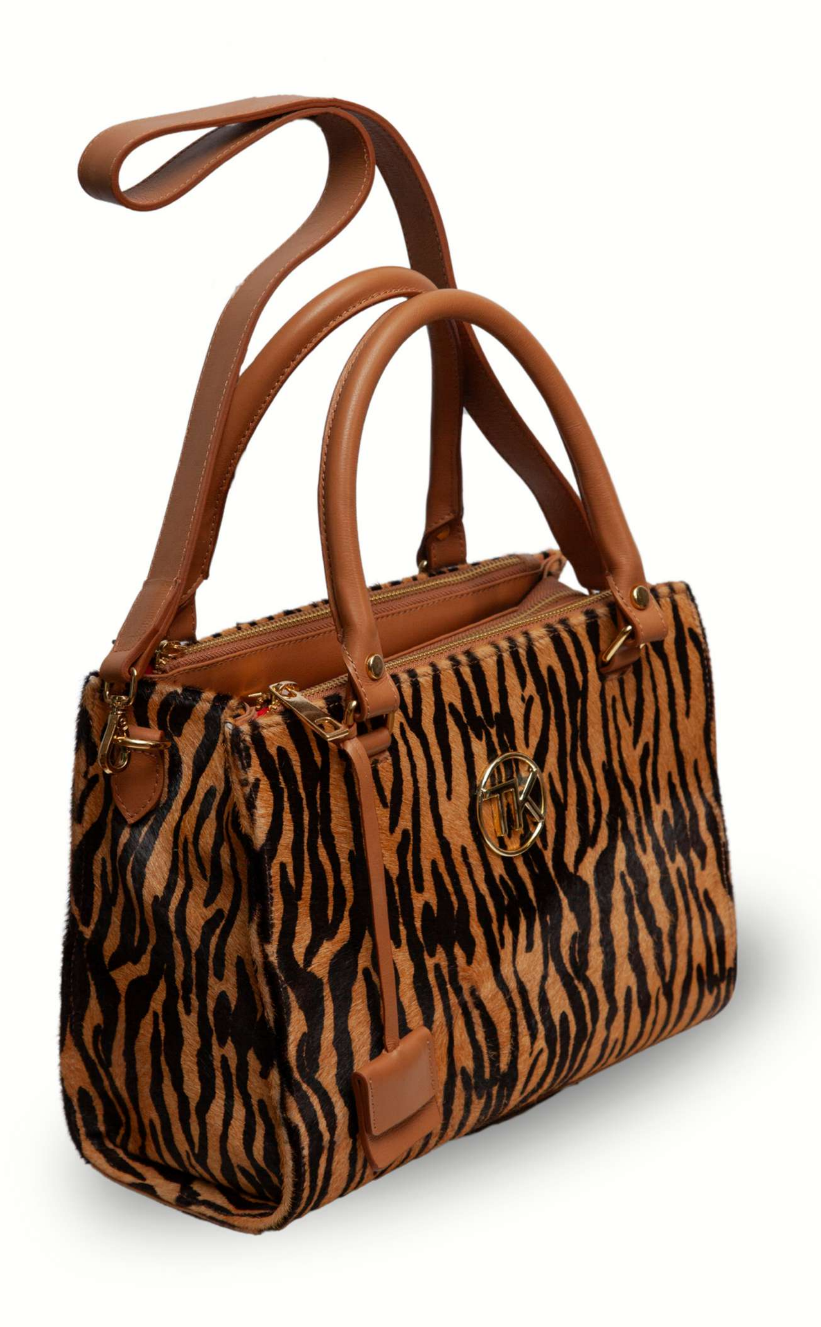
Ref. 151 B = VERONA / A 23 L= 29 P = 14