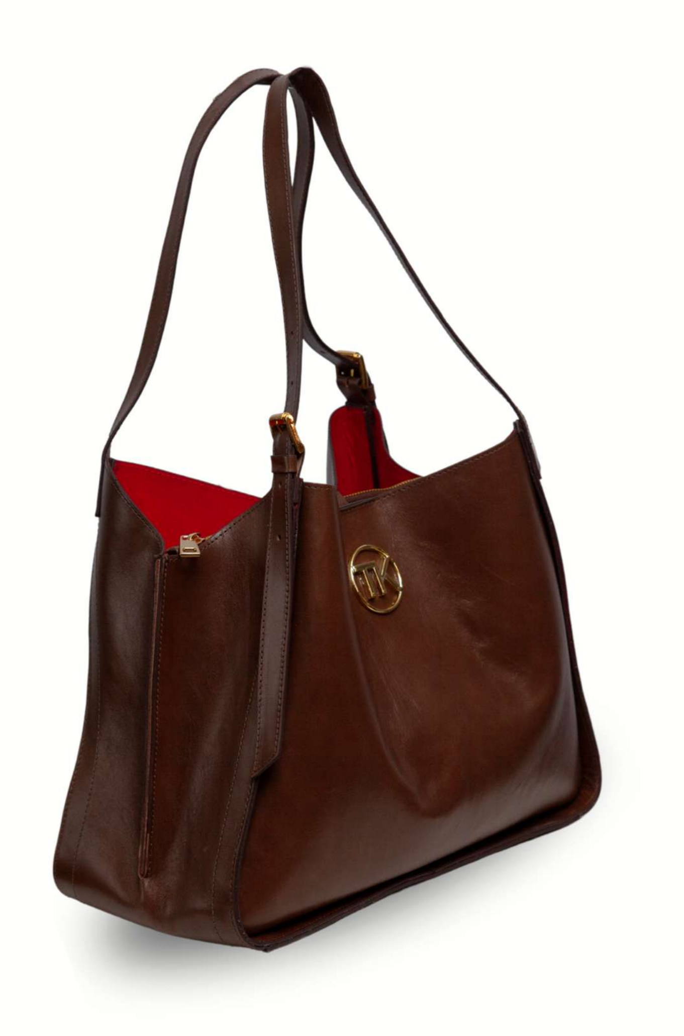
TININ/ for you. for all.