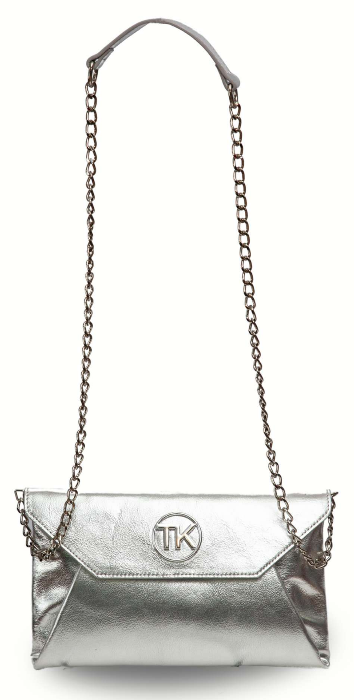
TINIX for you. for all.