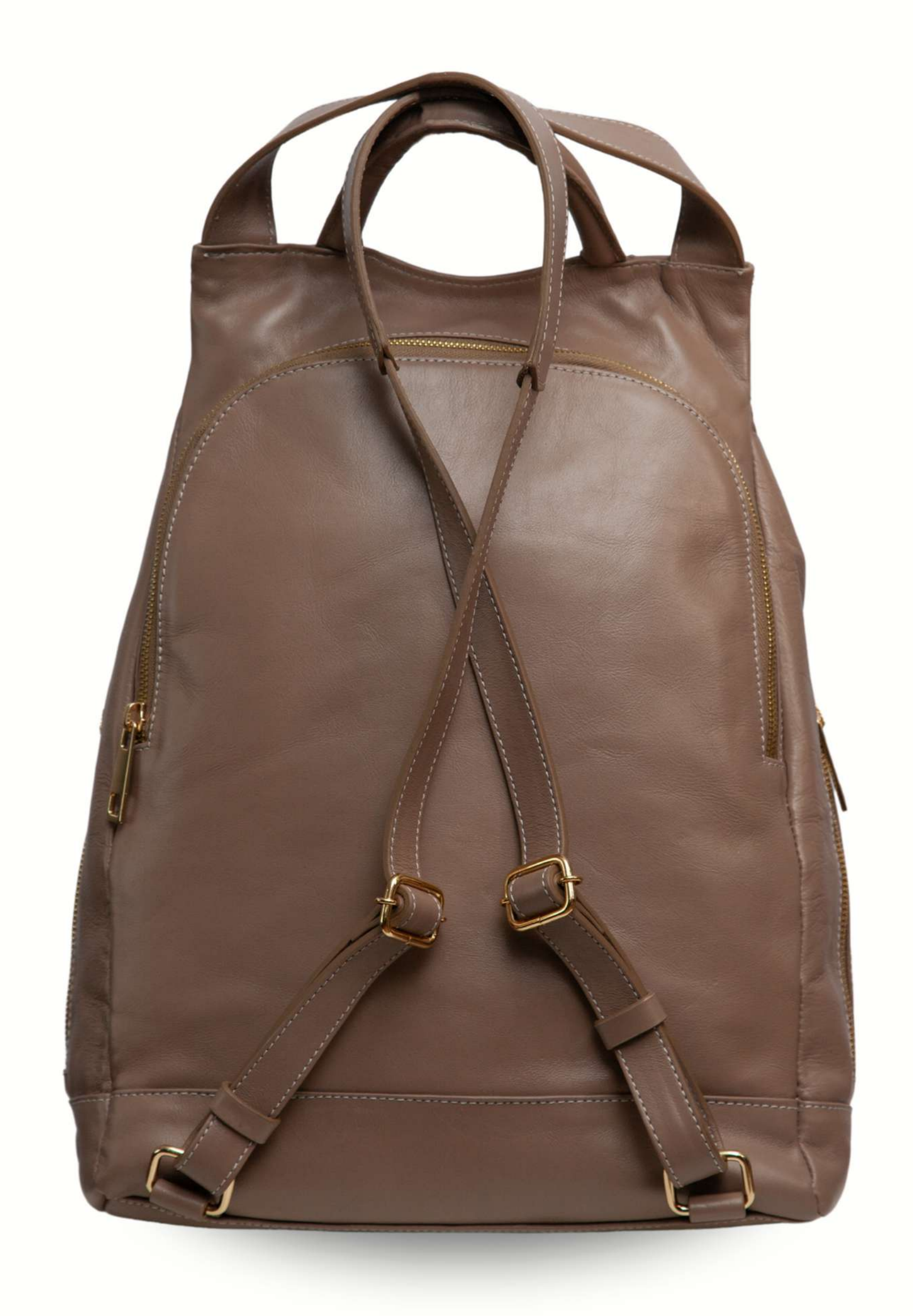
Ref. 174 = IPANEMA / A = 41 L = 31 P = 5