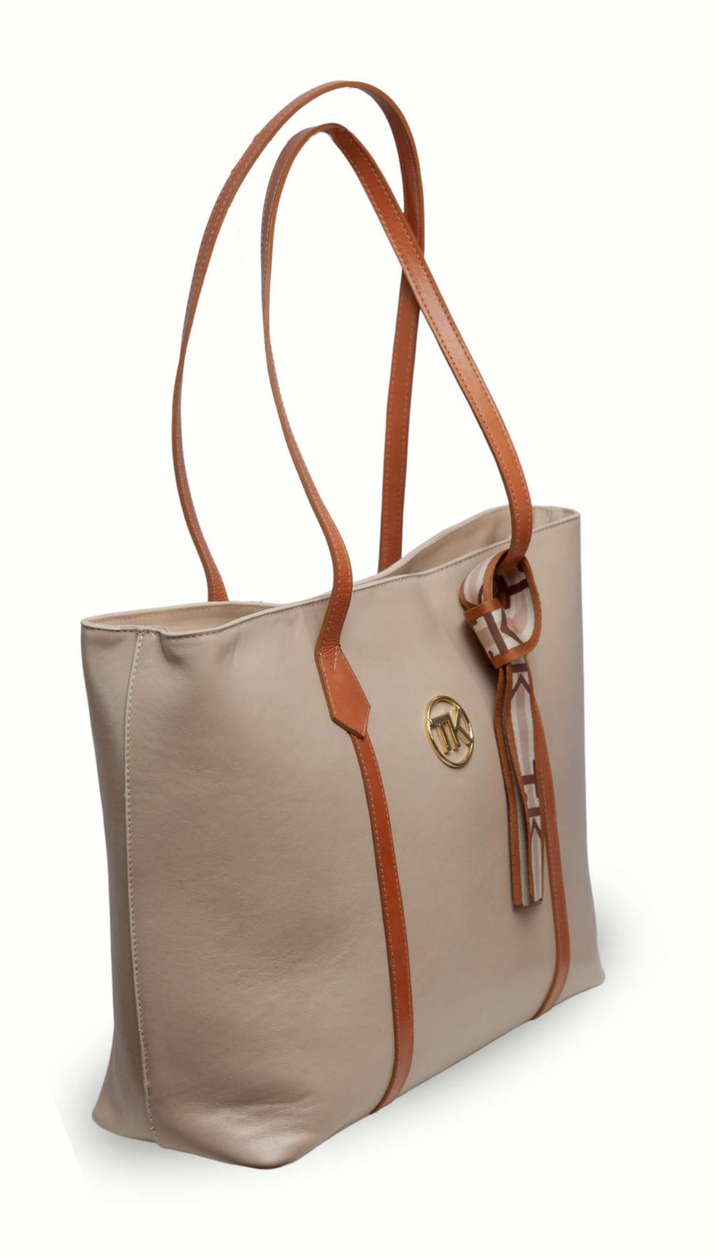
REF. 177 TÓQUIO / A=30 L =45 P=18