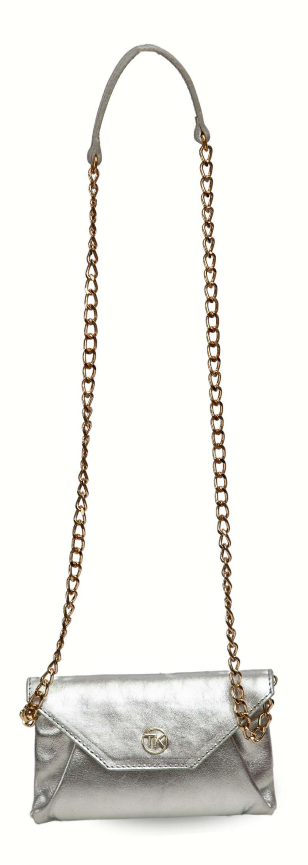
REF. 173 A VALÊNCIA / A=12 L=19 P=3