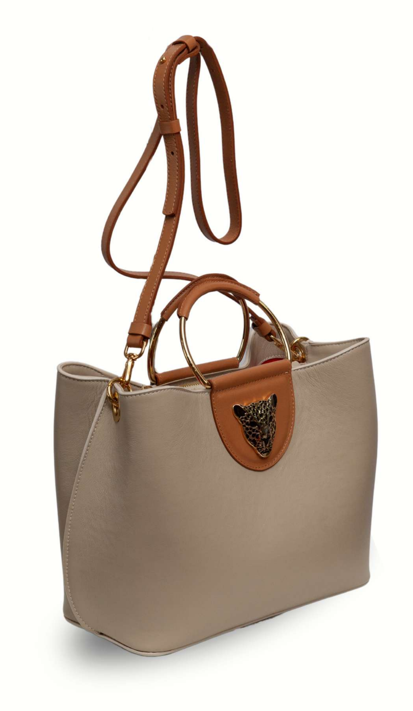
TININ/ for you. for all.