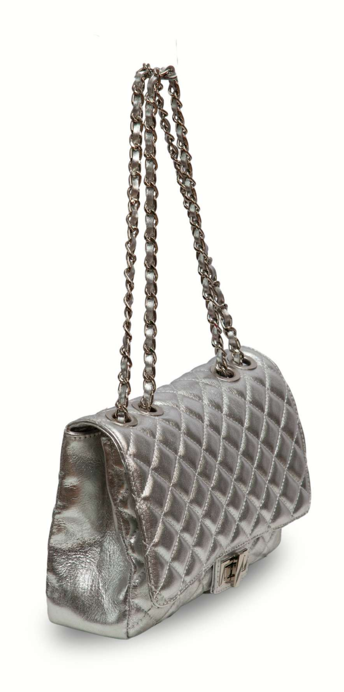
REF. 137 FILIPINAS / A= 18 L = 26 P= 9