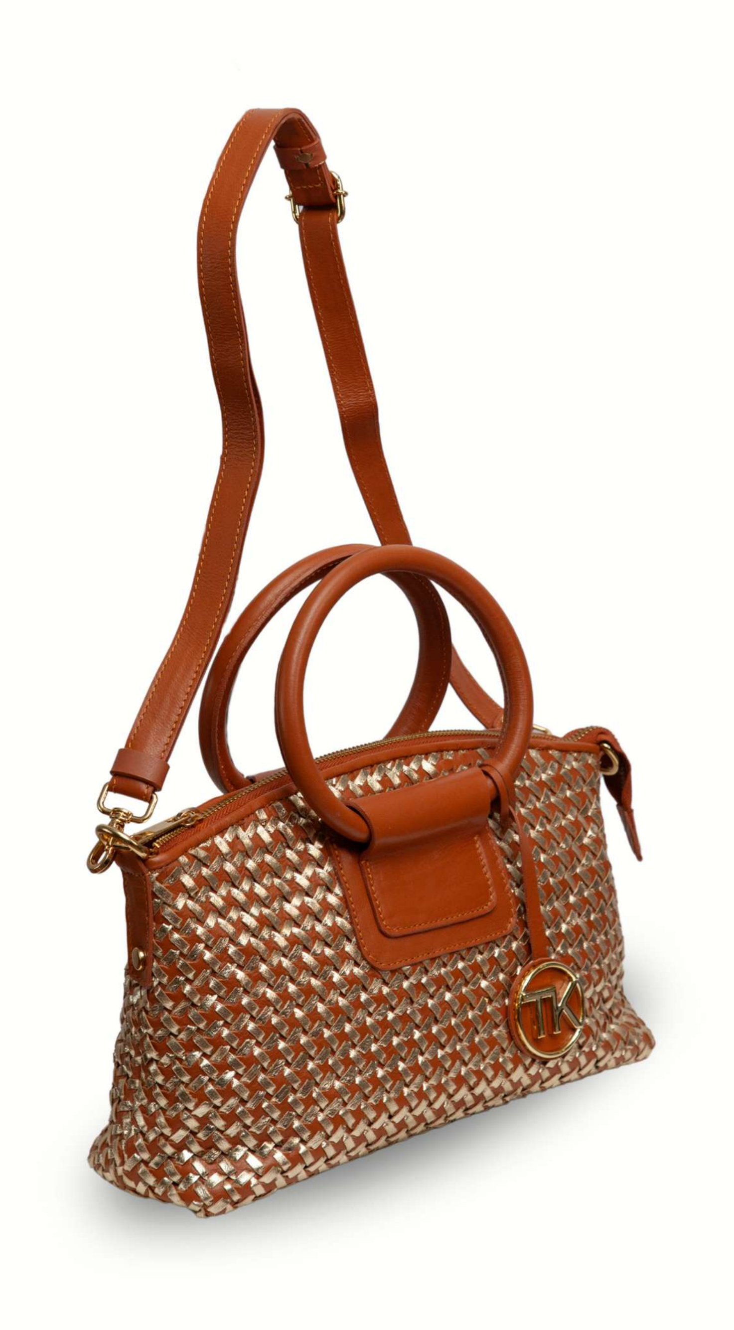
REF. 175 BARCELONA / A= 20 P= 30 P = 13