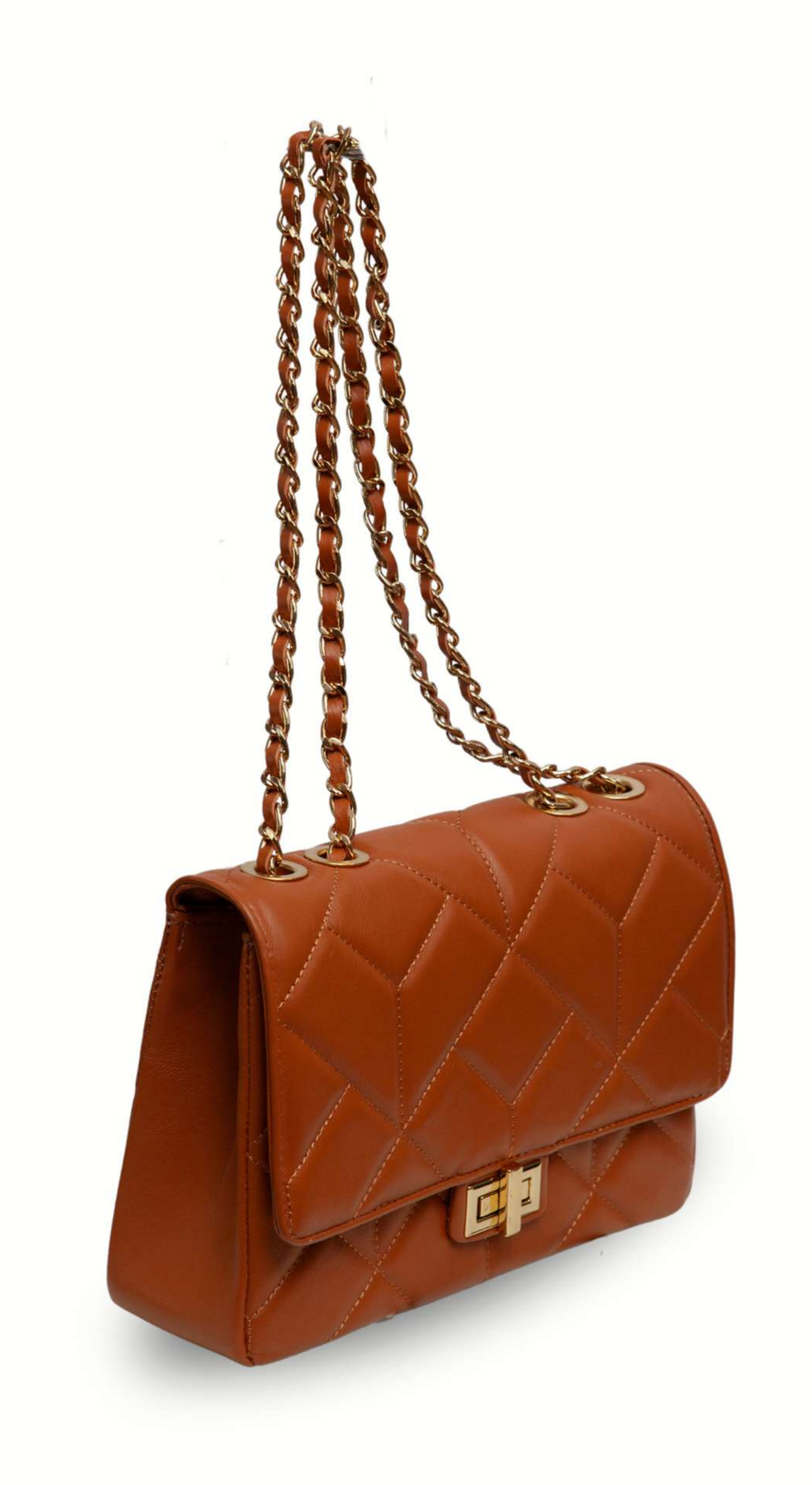
TININ/ for you. for all.