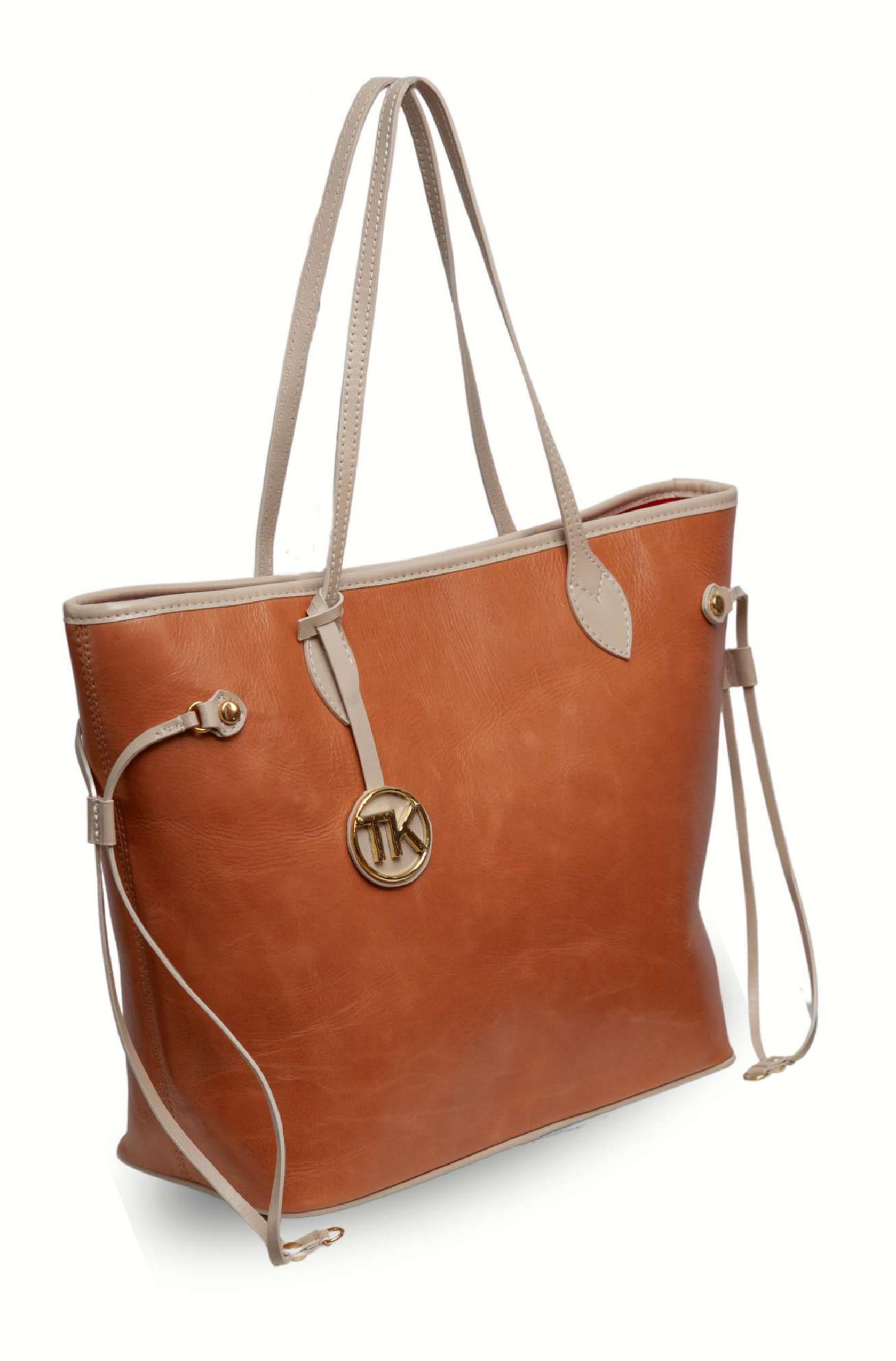
REF. 175 ANDORRA / A= 29 L = 41 P=32