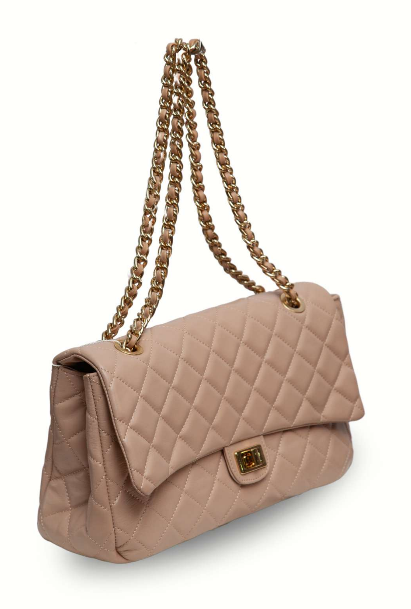
REF. 164 TURIM / A= 20 L = 35 P=12