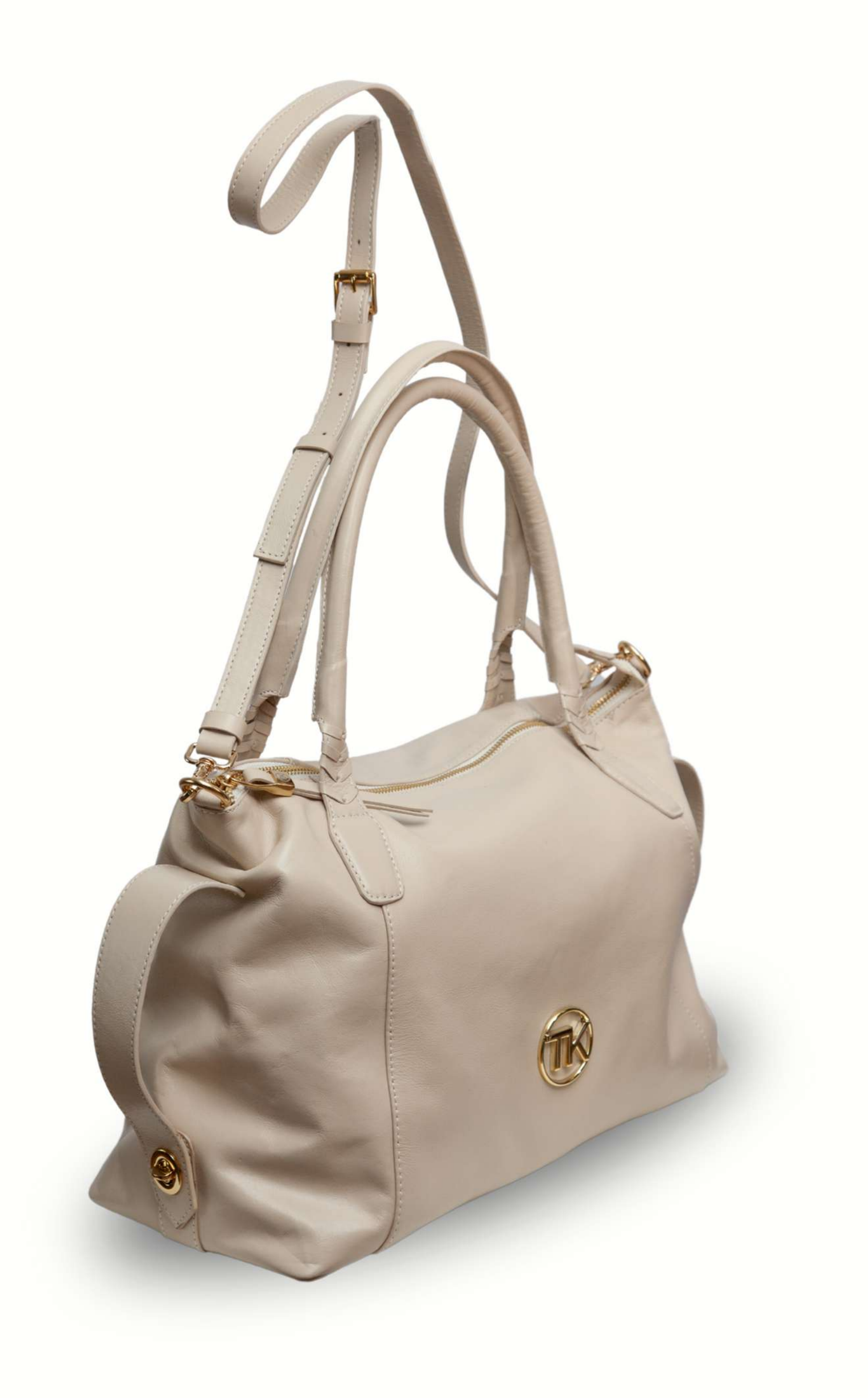
REF. 172 IBIZA / A= 26 L=40 P=19