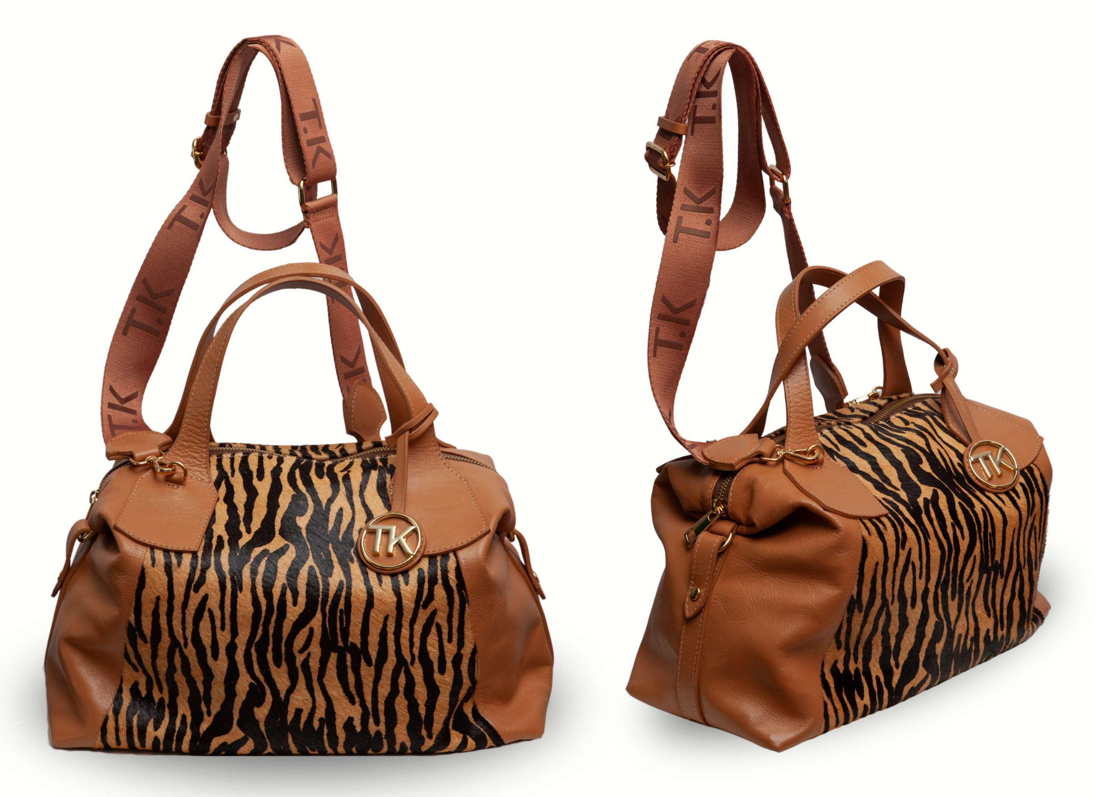
Ref. 180 = DUBLIN / A=20 L=36 P = 17