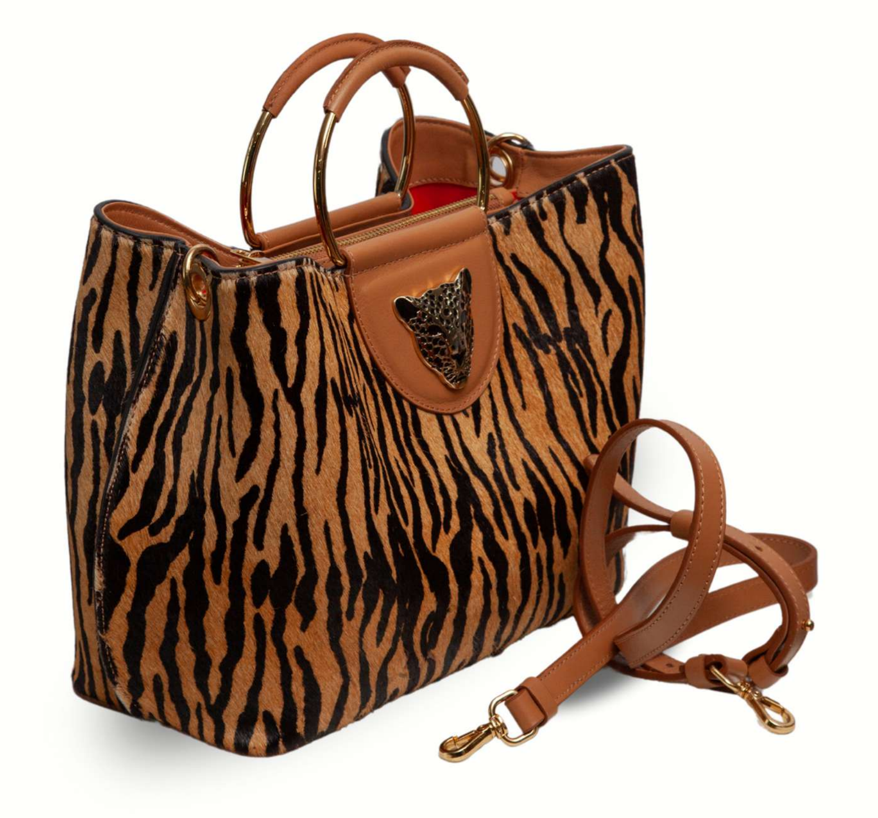
Ref.142 A = ASPEN / A = 23 L = 55 L = 16