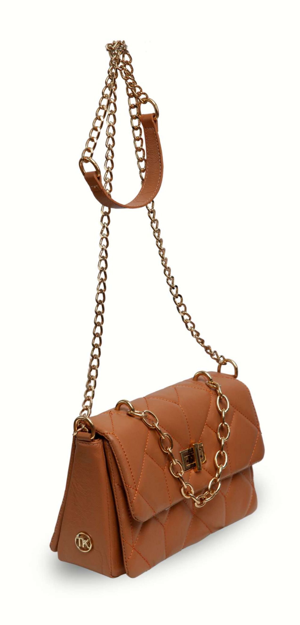
TININ/ for you. for all.