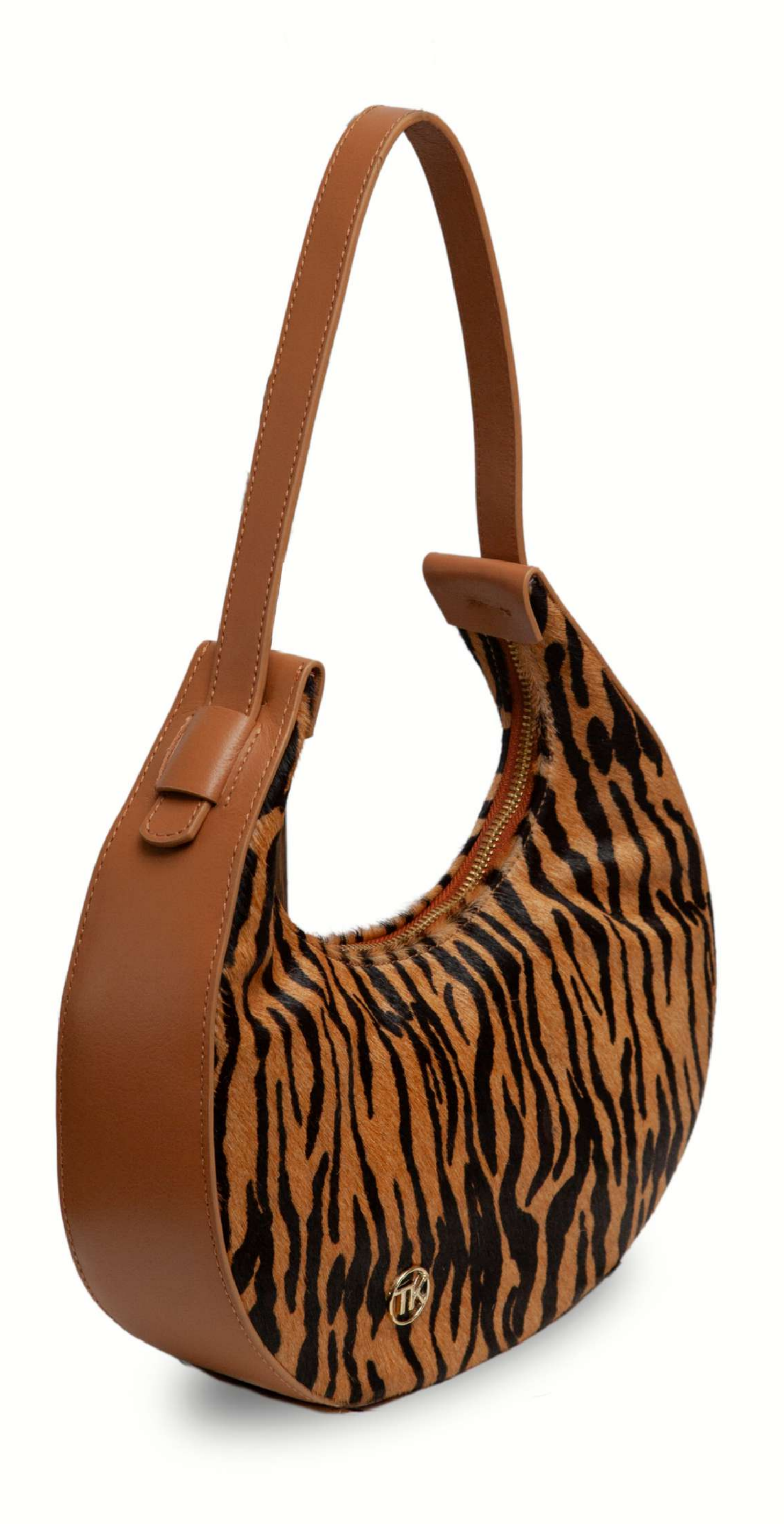
Ref. 121 B = CANCUN / A = 26 L = 28 P = 9