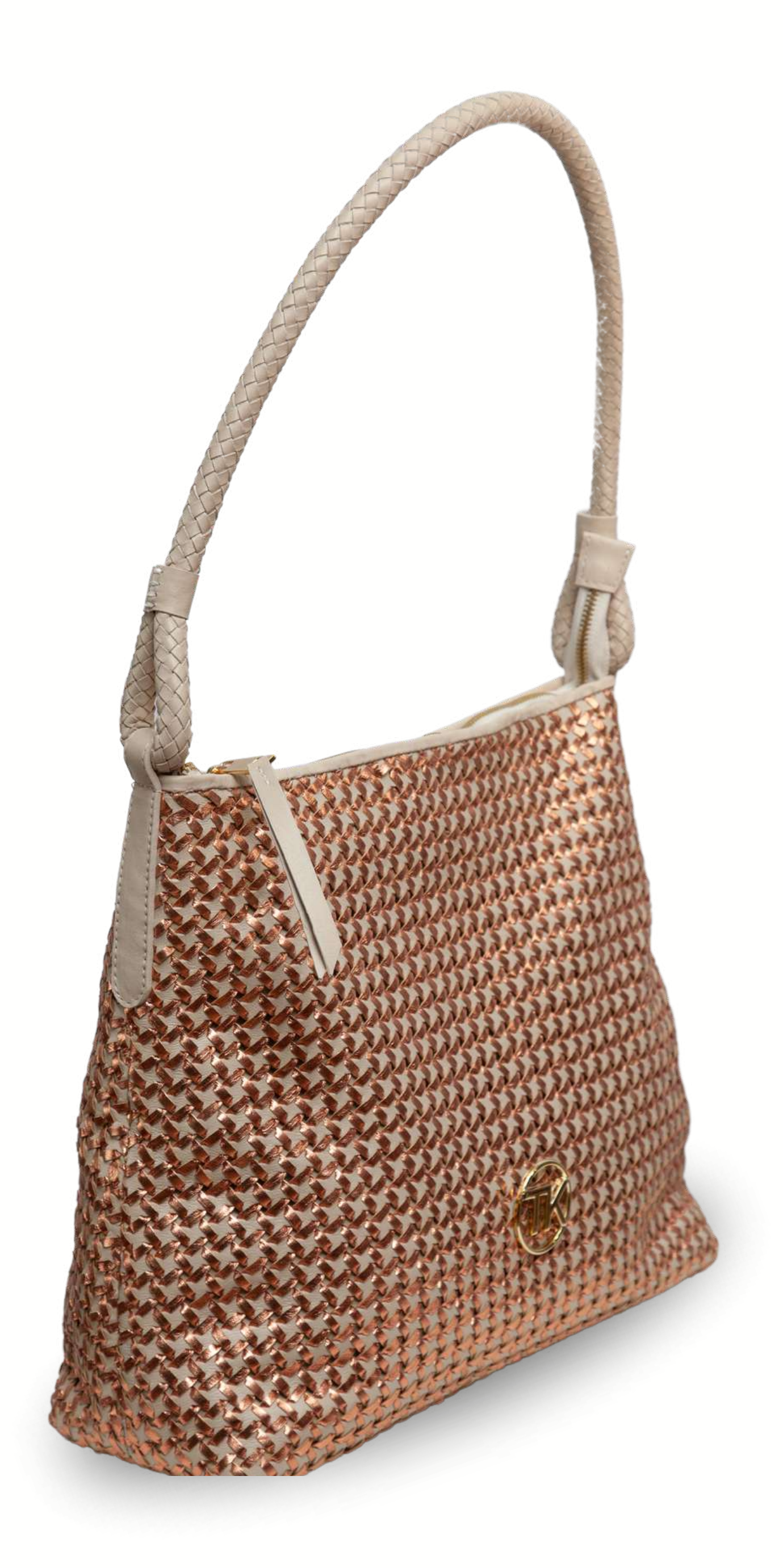
Ref. 170 A = VERSAILLES / A=30 L=35 P=13