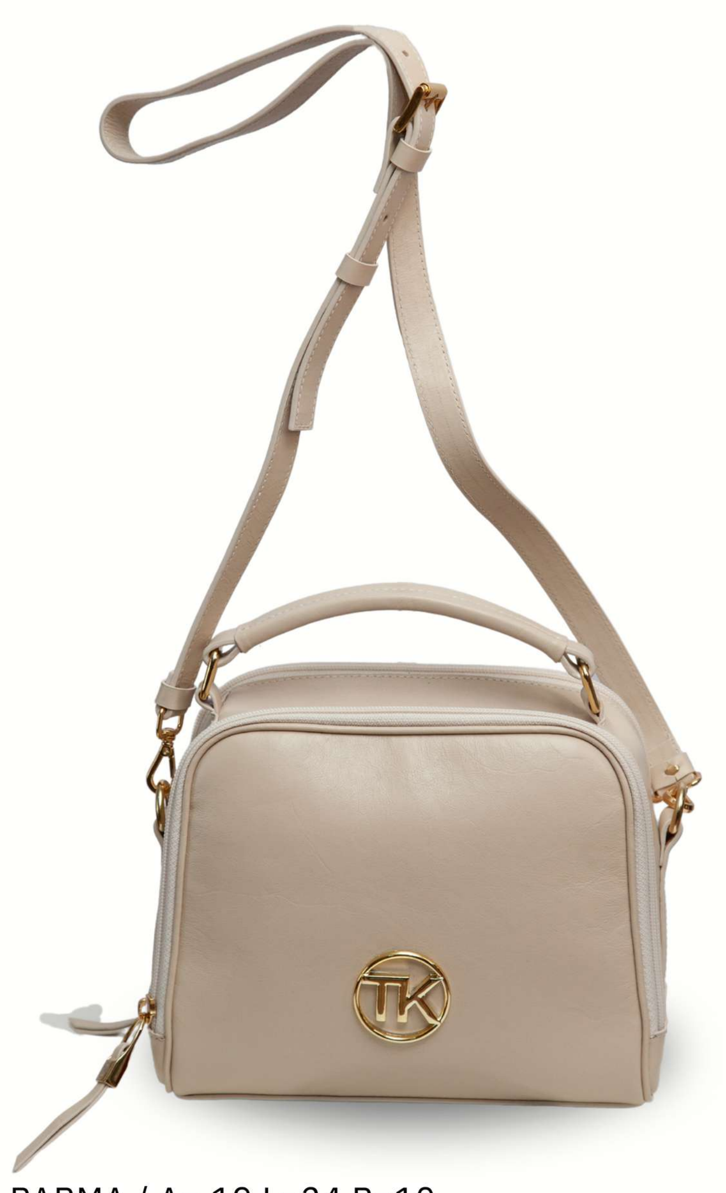
REF. 168 PARMA / A= 19 L=24 P=10