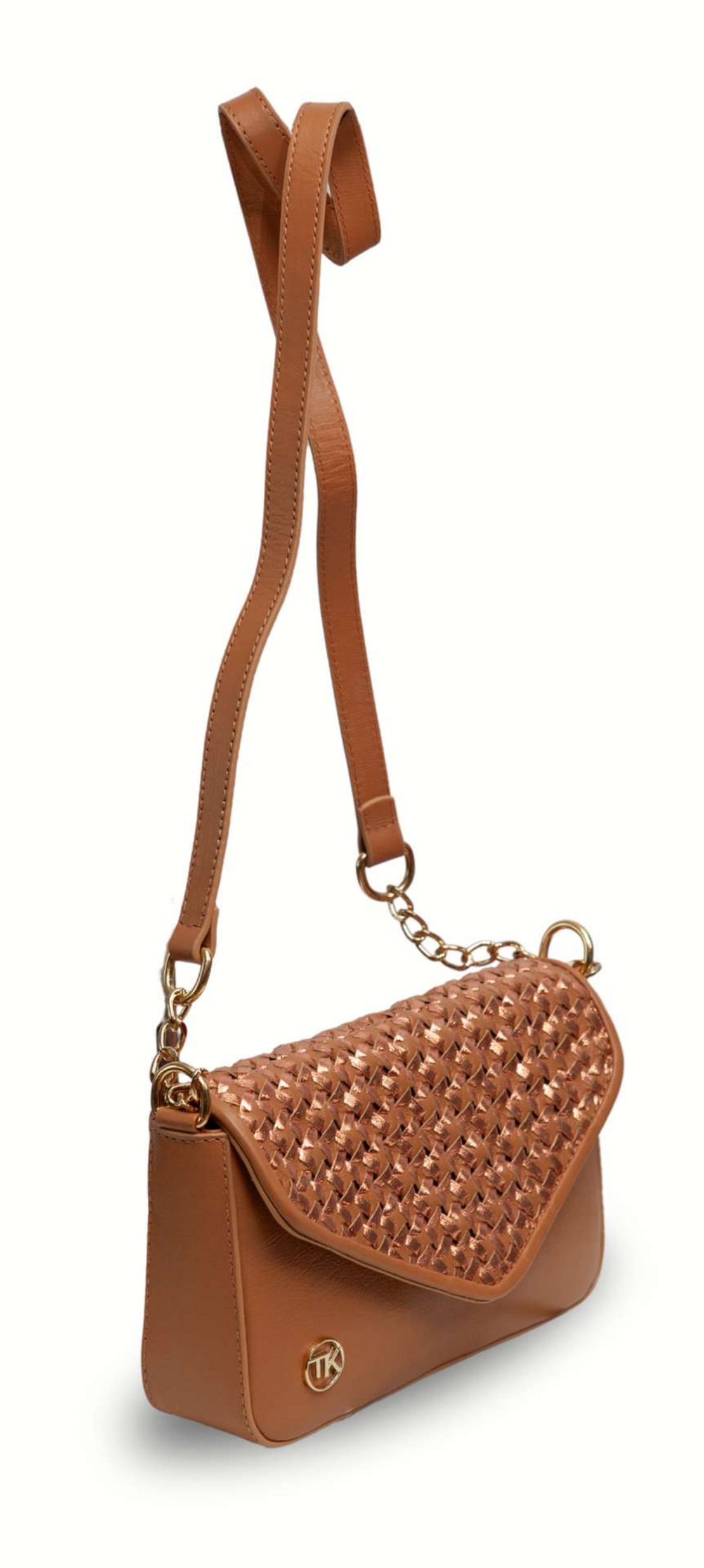
TININ/ for you. for all.