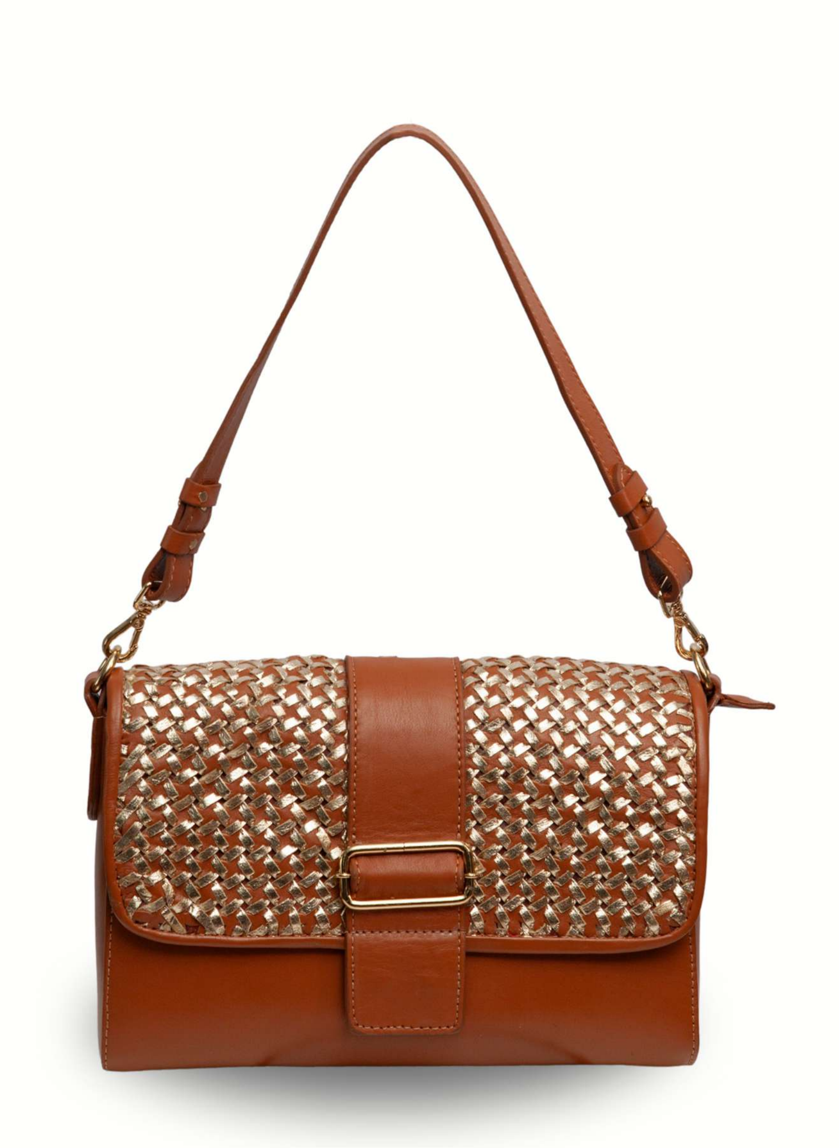
REF. 139 A FLORENÇA / A= 18 L=17 P= 7