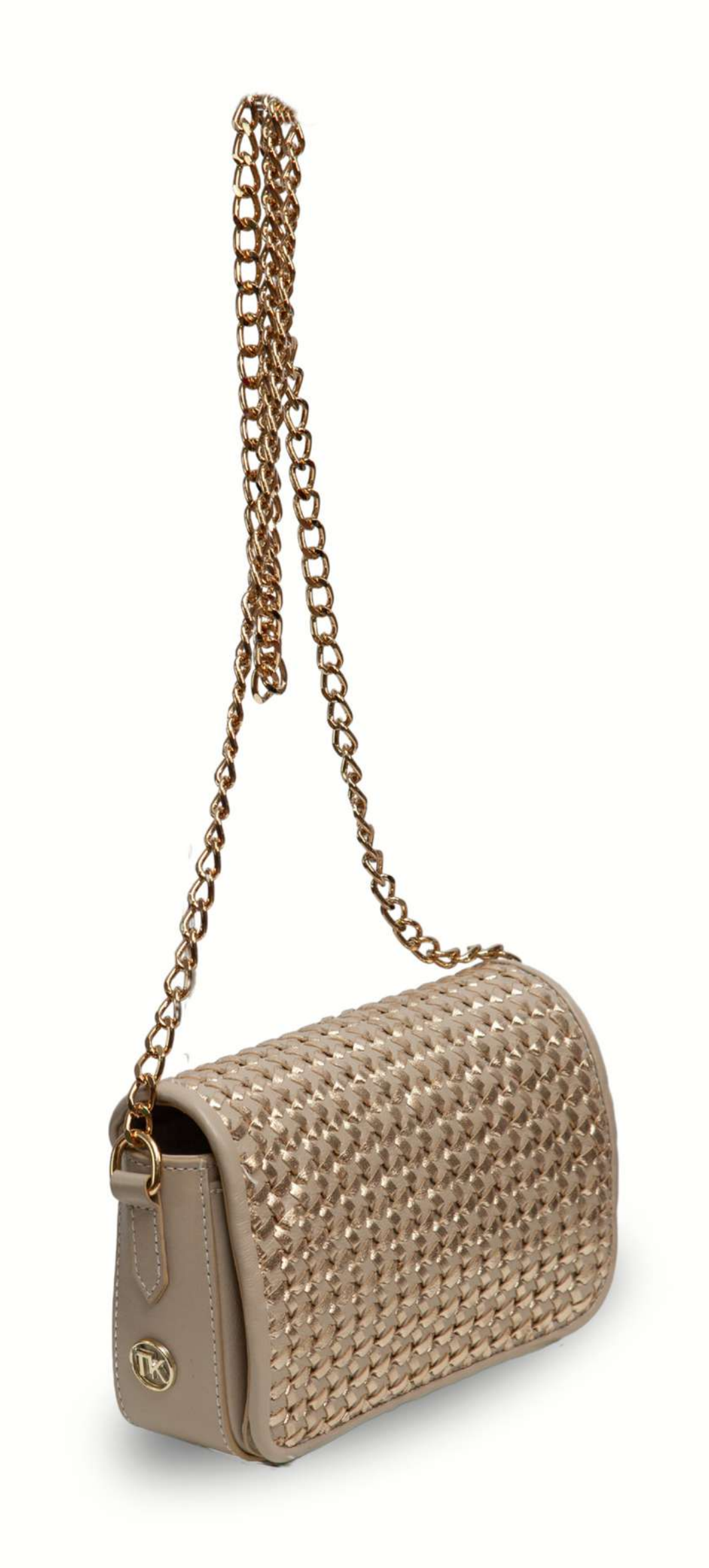
TINI/\ for you. for all.