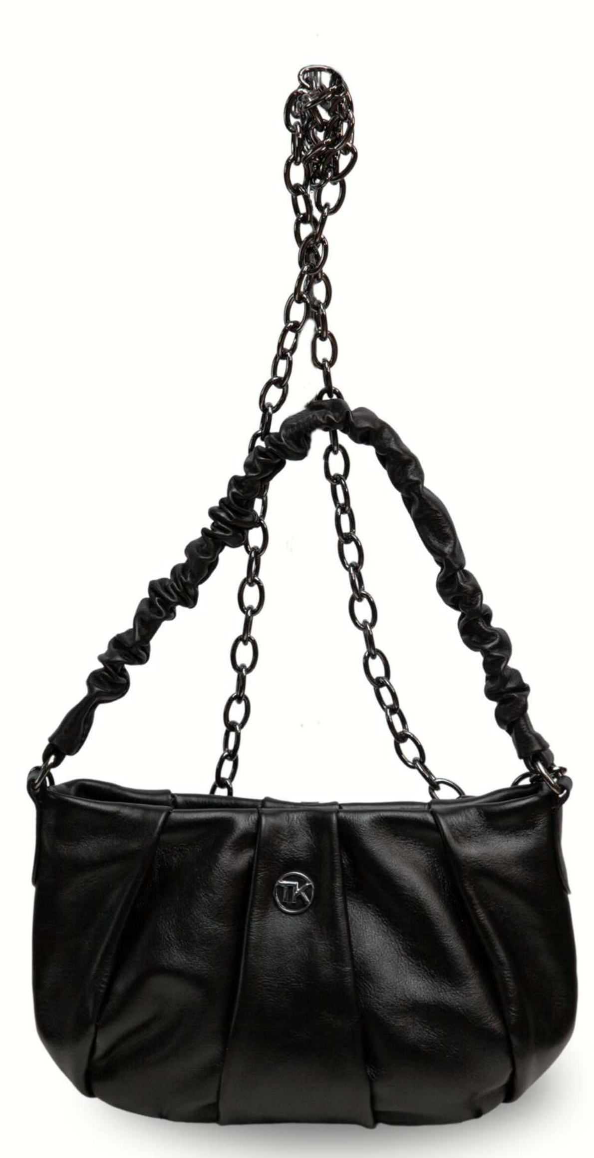
TININ/ for you. for all.