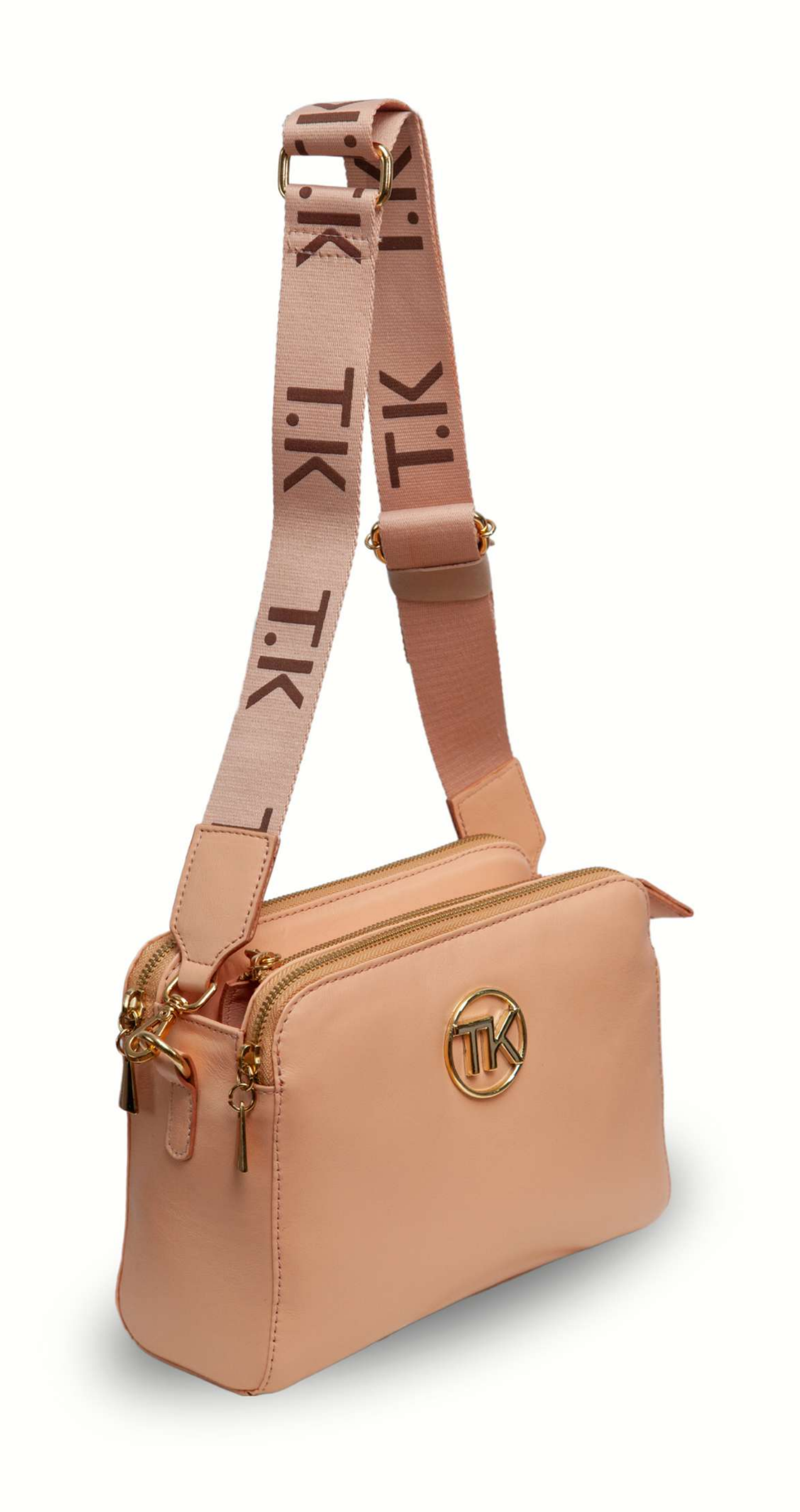
REF 159 MONTREAL / A= 18 L=14 P=10