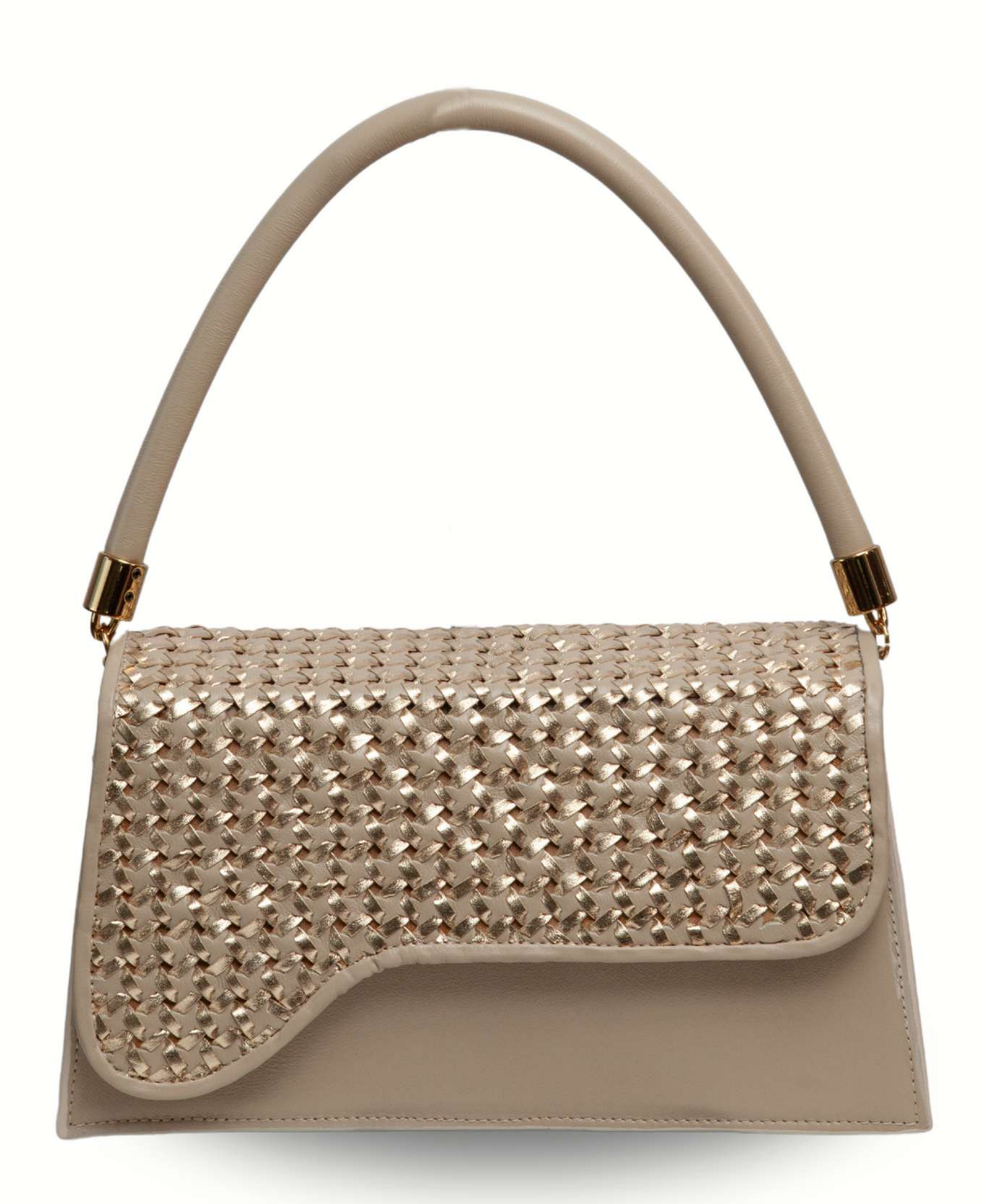
REF. 102 A LAS VEGAS / A= 16 L =29 P =10