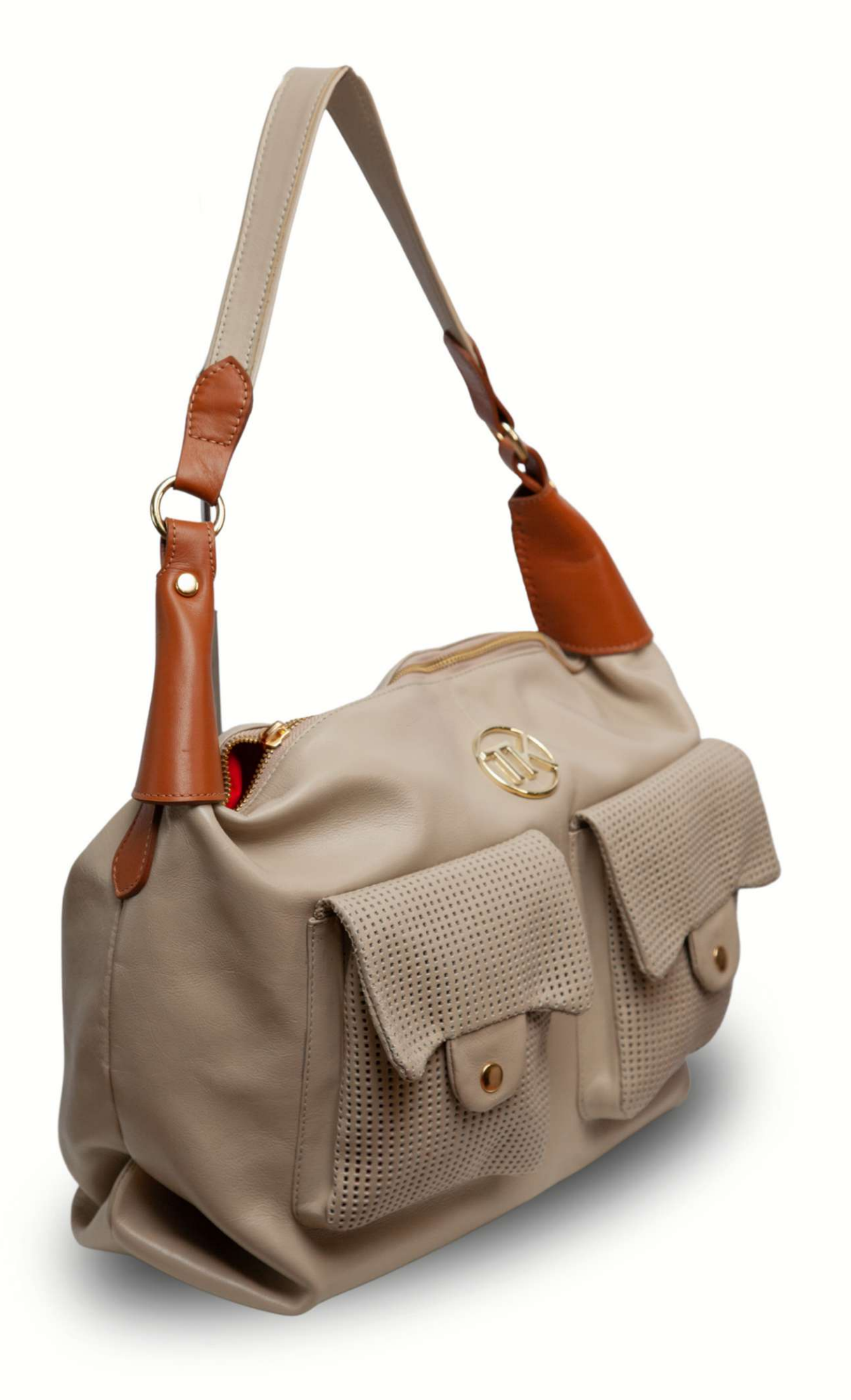
REF. 156 CANNES / A= 28 L=46 P= 19